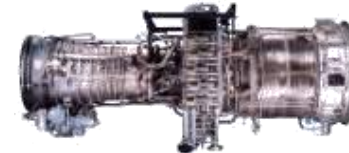
LM2500+ 28-34 MW