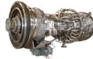
LMS100 100 MW