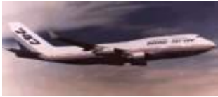
B747 B767, MD-11, A310/330